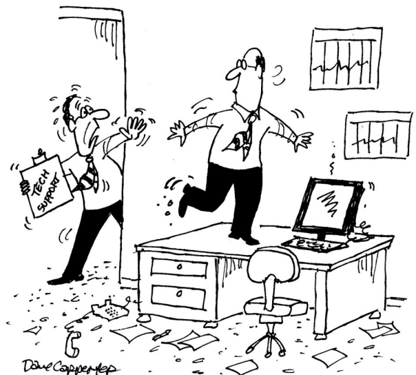
"Hold it! That's not what they mean by 'reboot'."